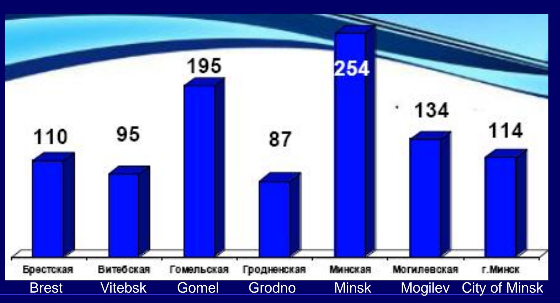
E. V. Belskaya Zabolevaemost rabotnikov zdravookhraneniya gemokontaktnymi infektsiyami i ikh profilaktika / http://www.epsu.org/a/9069

NUMBER OF HEALTHCARE WORKERS IN THE REPUBLIC OF BELARUS WHO CONTRACTED BLOOD-BORNE INFECTIONS (2009-2011)