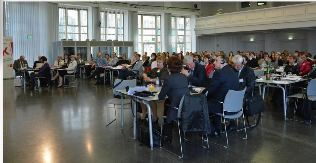
Picture of the participants from 12 countries